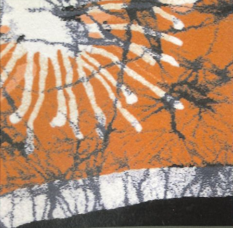
18 Magic Carpets from Ernabella The State Library of South Australia rugs project— Pamille Berg