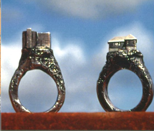
30 Workshop 6: Fluidity and Solidity Marking ten years— Grant Thompson